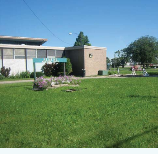
Kemeny Recreation Center Detroit