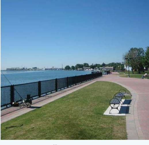
Ecorse Riverwalk John D. Dingell Park Ecorse