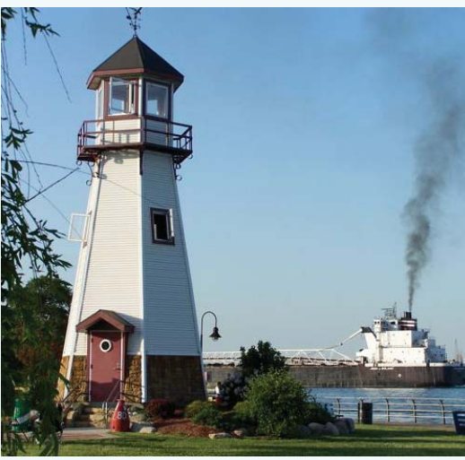
Mariners Memorial Lighthouse Dr. Henry Belanger Park River Rouge