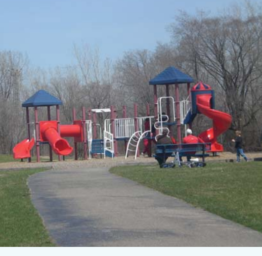
Council Point Park Lincoln Park