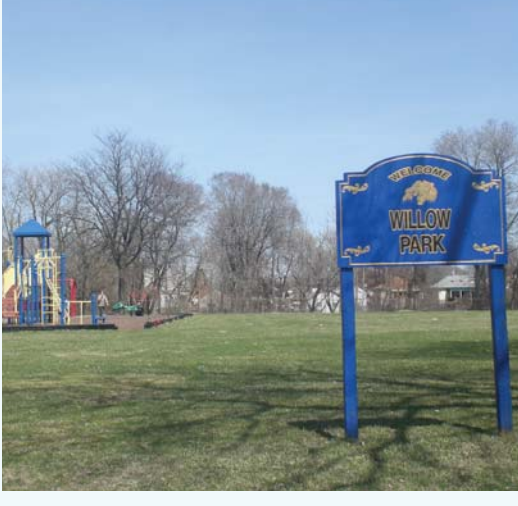
Willow Park Lincoln Park