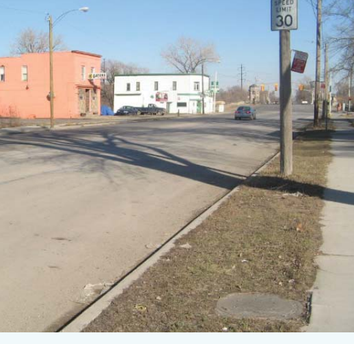
Planned Fort Street Greenway Detroit