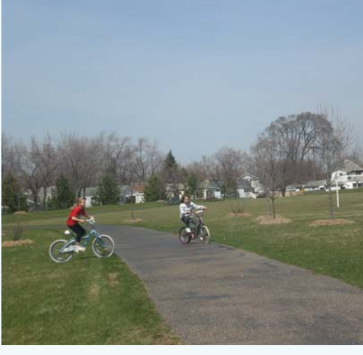
Council Point Park Lincoln Park