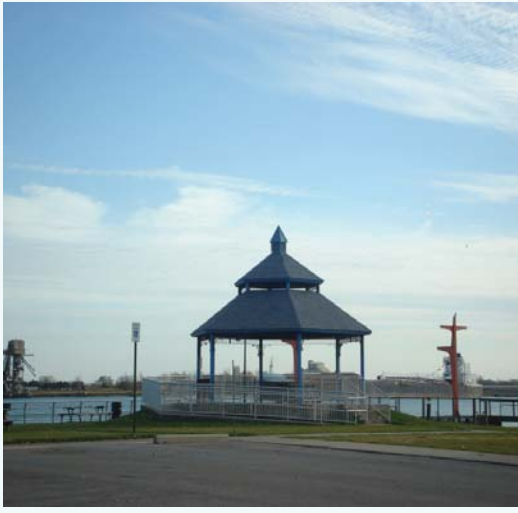
Memorial Park River Rouge